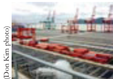
2002. GPS guided cranes in Kwangyang, Korea