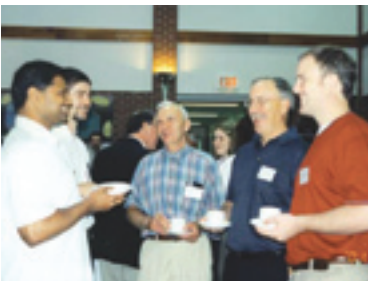
2001. 40 th Anniversary celebrations