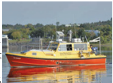
2002. CSL Heron