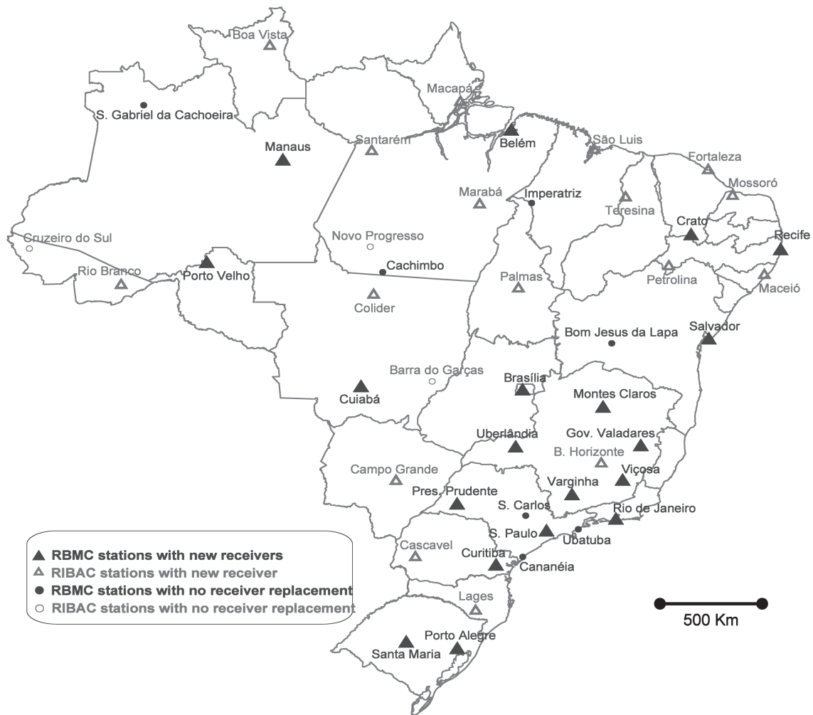
Fig. 3 Active geodetic network resulting from the integration of RBMC and RIBaC. The stations represented as triangles will have real time capability, whereas the remaining ones will continue to work in post-mission mode

collaborate and assist in Brazilian efforts towards the adoption of a geocentric coordinate system (SIRGAS2000) compatible with modern satellite positioning technology. Project activities include technical issues, study on the impacts resulting from the adoption of the new system and communication with user community. The modernization of the RBMC corresponds to PIGN Demonstration Project #7. This Demo Project aims at providing the background for the implementation of a modern reference structure that facilitates the connection to the Brazilian geodetic system by users. Since the corrections will be implicitly attached to SIRGAS2000, their application by the users will result in SIRGAS2000 coordinates. Users will be directly attached to SIRGAS2000 in their positioning and