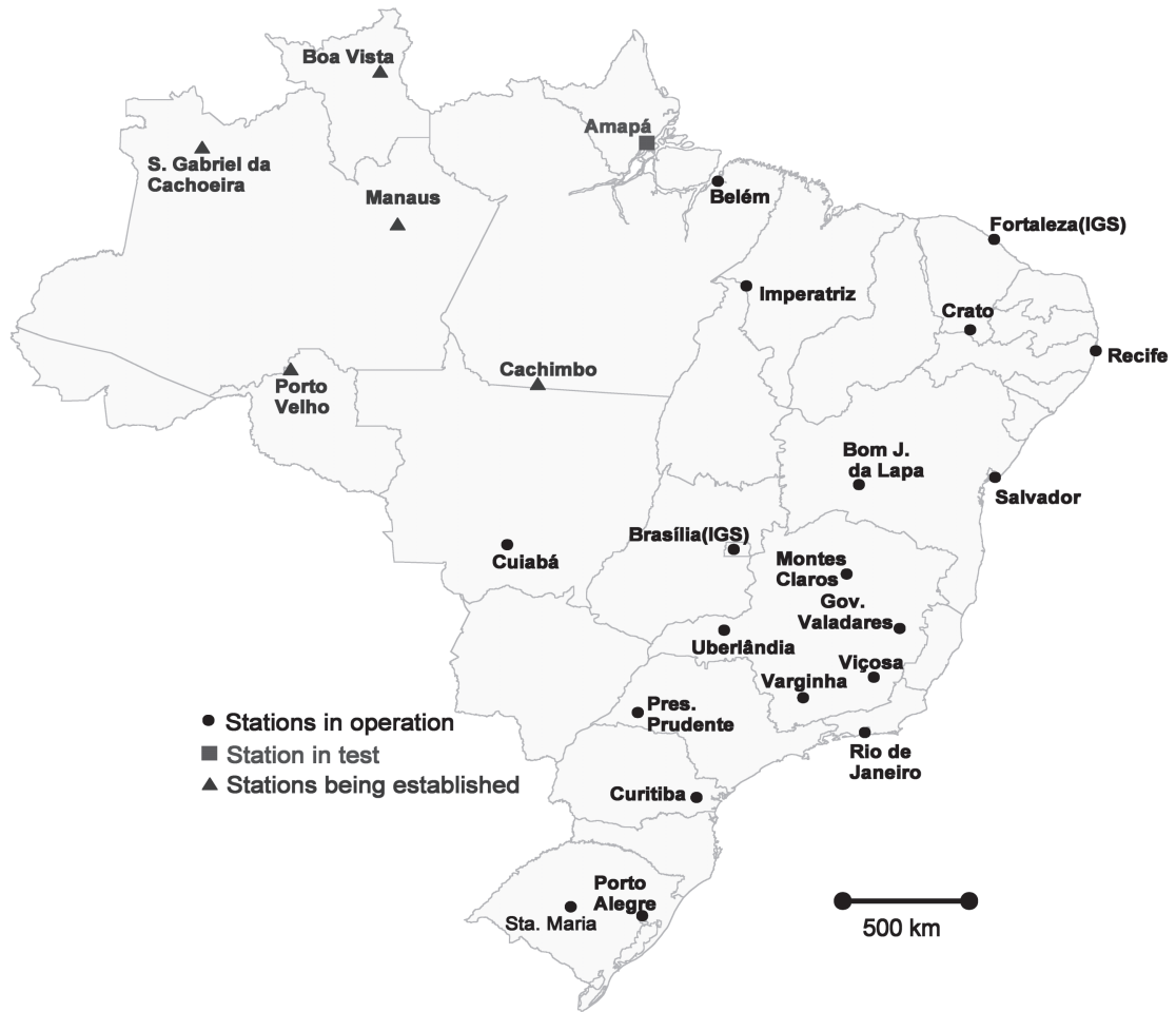
Fig. 1 RBMC stations in operation, in test, and being established